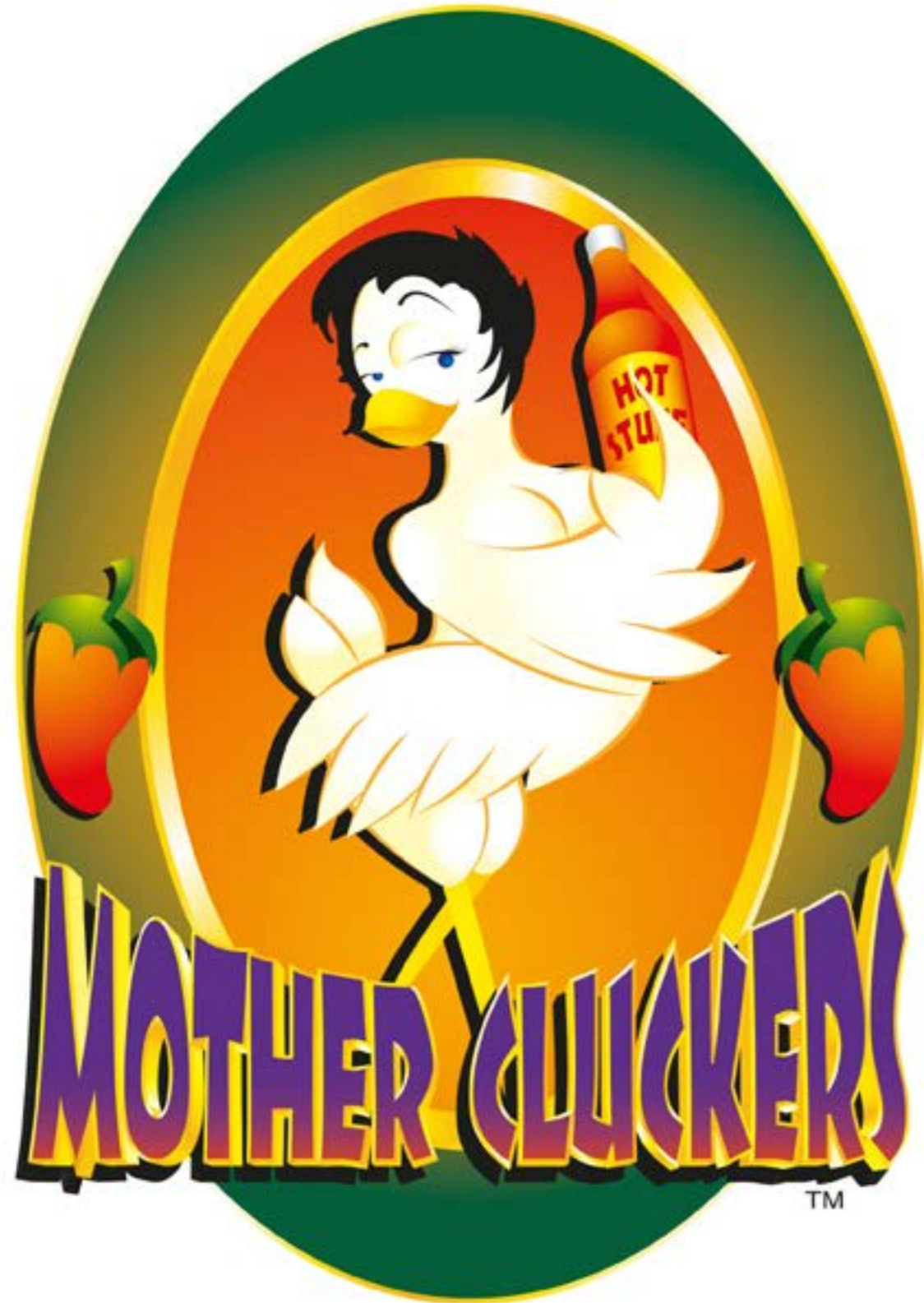
Mother Cluckers (1999) - Logo, concept, design & illustration