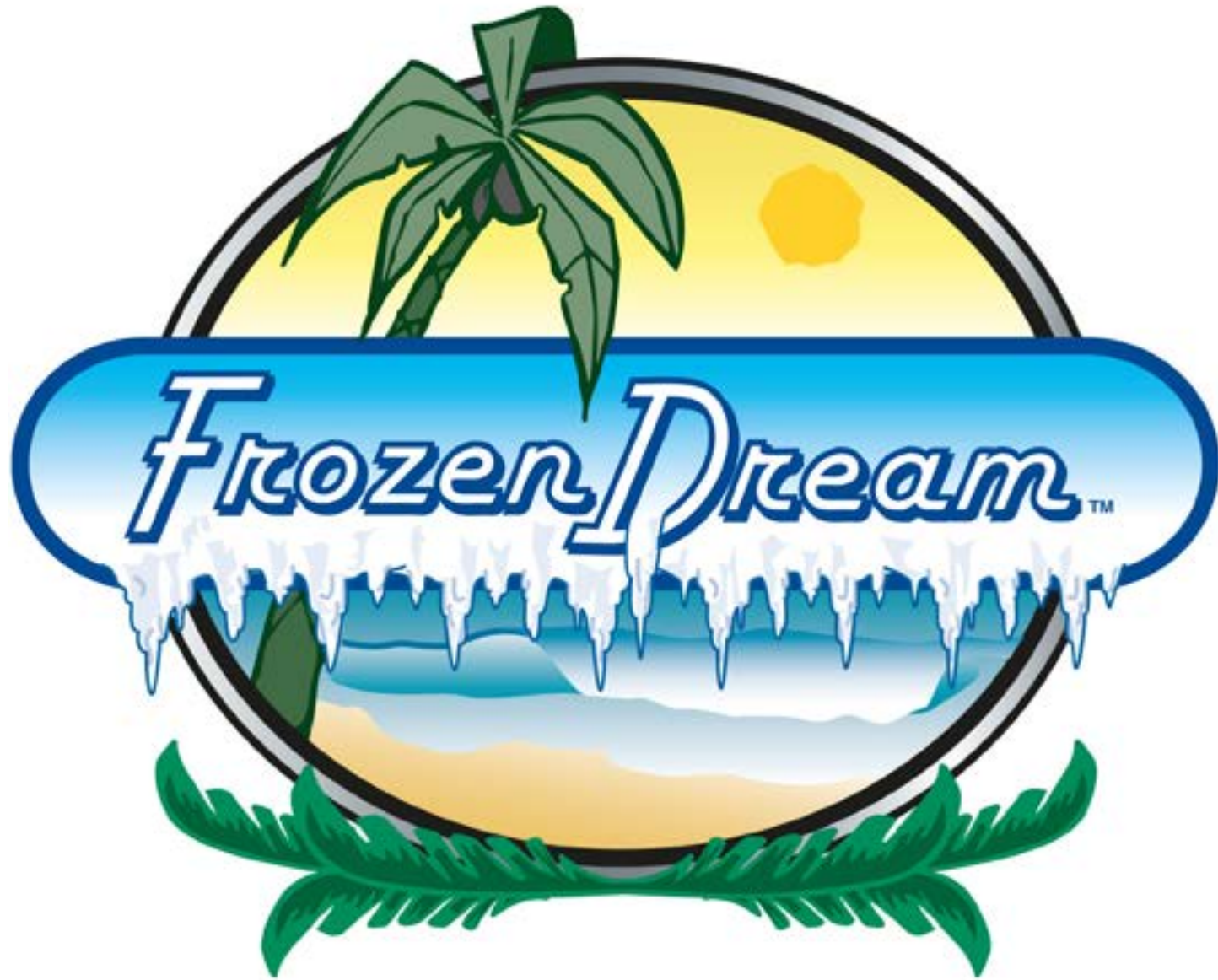
Frozen Dream (2016) - Logo: concept, design & illustration